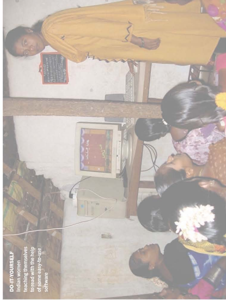
DO-IT-YOURSELF Indian women teaching themselves to read with the help of some easy-to-use software